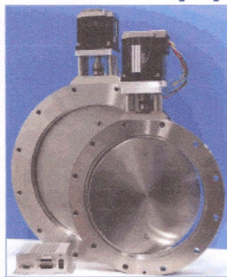
New Throttling Valves

M DC now offers a full line of High-Cycle, Throttling Butterfly Valves (TBV) exclusively developed from a proprietary process controller architecture. High performance, motion control,