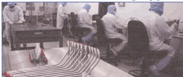
Complex Gas & Chemical Delivery System Assembly

An accompanying next generation (using adaptive control algorithms) Process Controller is available as well, which features a small footprint, high-speed I/O's, 24-bit analog, and